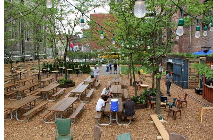
“pocket park” Philadelphia, PA